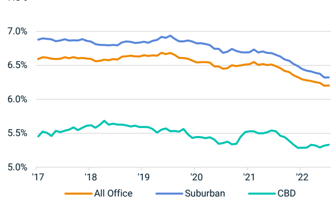
Trailing 12-mth cap rates; volume YOY change truncated at 150%

Read Insights for timely data-driven analysis of market trends from across the commercial real estate universe.